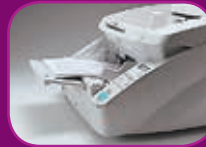
Highest position (100 sheets)

The document feeder has three selectable feeding modes (100, 300 and 500 sheets) that are adjustable according to the volume of the batches being scanned, saving time and increasing overall throughput.