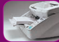
Middle position (300 sheets)