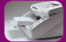
Lowest position (500 sheets)